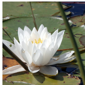
Fragrant Water Lily

It's become one of our favorite activities and we'll do it again to celebrate America's Independence Day. Join us at the Boat Ramp on Youngs' Ridge Road when we kick off with a rousing tour of the lake at 10:00AM.