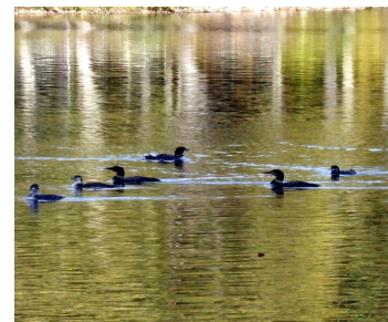
Loons gathering for migration