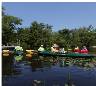
Plant paddlers on Wilson Lake