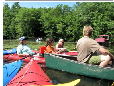
Plant Paddle on Wilson Lake—2012